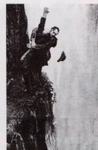
Holmes and Moriarty at the Reichenbach Falls

3 What did Conan Doyle think of his Sherlock Holmes stories?